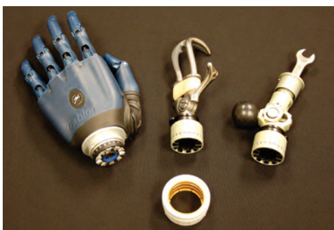
Figure 2: The use of disconnect wrist and myo/body-powered wrist adaptors allow for the evaluation of myoelectric, body-powered, and activity-specific options in one preparatory fitting.

Various authors suspect the rate of upper-limb amputations is decreasing secondary to improvements in limb salvage and reconstruction as well as occupational safety. What is striking is the effect that emerging technology may have on the available population that could benefit from upper-limb treatment. Five to ten years ago, the levels most commonly fit with a functional prosthesis were proximal to the wrist. As both